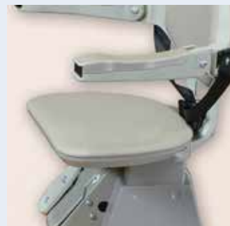
Power swivel seat for effortless exit. Armrest switch control or wireless call/send.