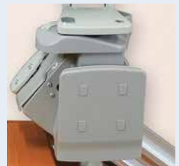
Power folding footrest automatically flips up/down when seat is raised/lowered. Arm switch control optional.