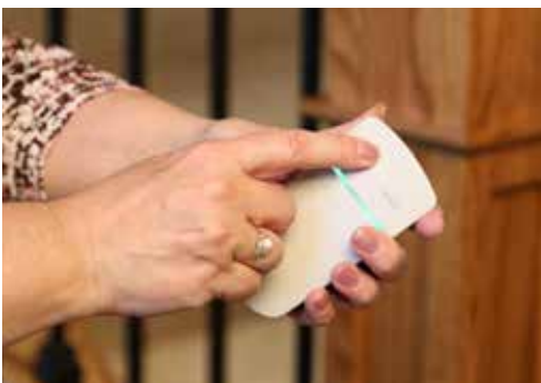
Two wireless call/sends allow remote control access.